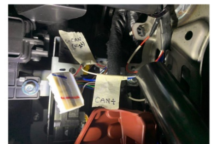
C-CAN(High) – Red / CAN(+) - White