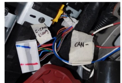
C-CAN(Low) – Blue / CAN(-) - Blue