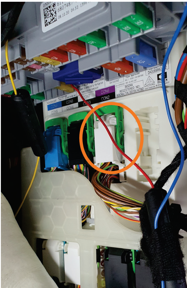
Pin function CAN High CAN Low

These models feature a "CAN powertrain" data bus accessible in different locations (i.e. under the gearbox lever, close to the steering column, in the wall on the right side of the car - footrest area - see following picture). It is strongly recommended to refer to a skilled technician to perform this kind of installation. Wire colours are standardized as indicated here below, and are always twisted together: