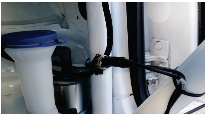
ITT Cannon 4 pin female conn.

These models feature a communication protocol based on CAN, accessible through the 4 pins ITT Cannon female connector (P.N: TR1004FRH1NB) placed on the passenger side. For this installation refer to the following pinout of ITT Cannon connector and its connection table.